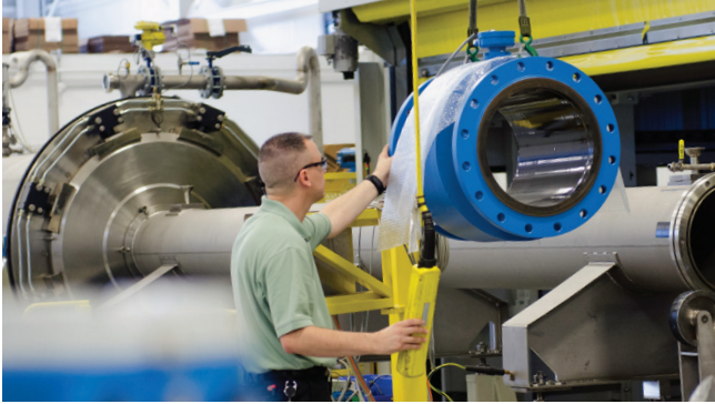
A worker hoists an electromagnetic flowmeter into position to be factory calibrated on the ISO 17025 certified calibration rig

The only process instrument manufacturer with the ability to provide you with both lab and field accredited calibrations