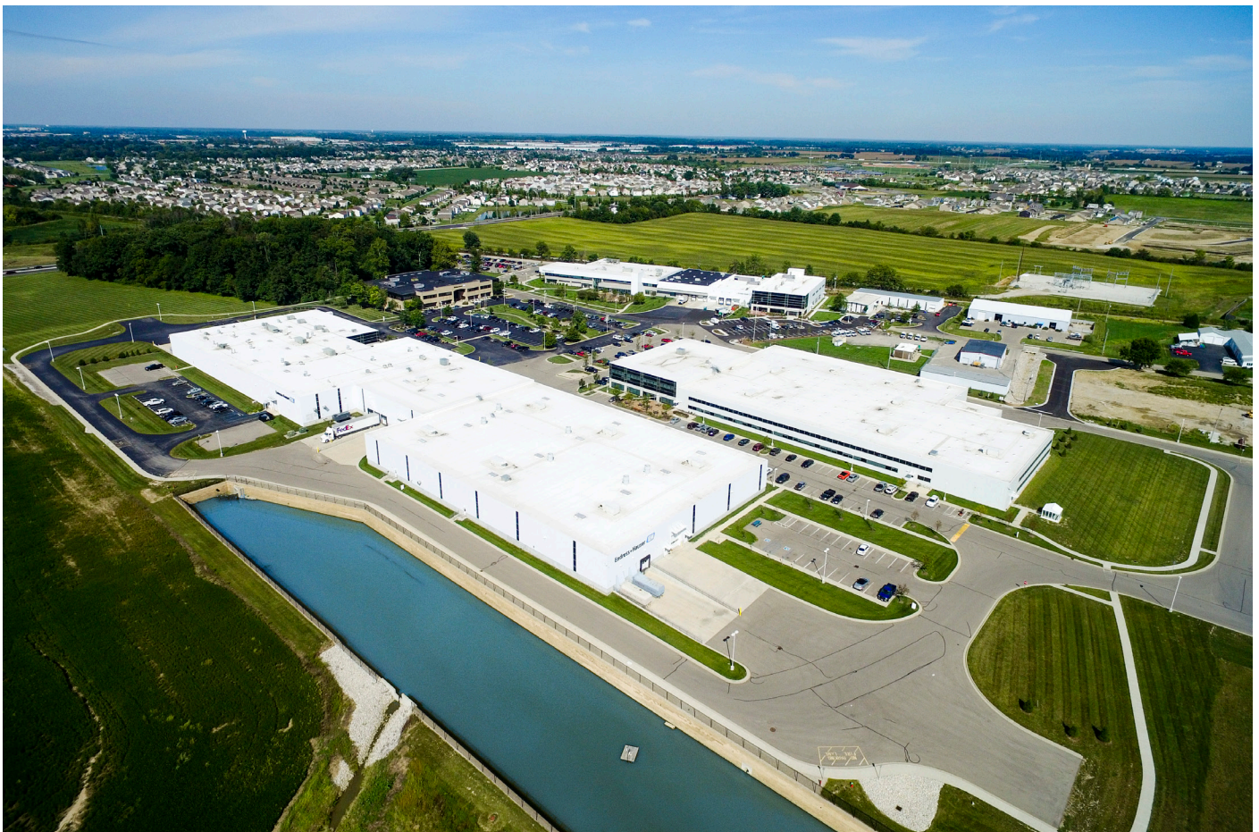
Aerial view of the Greenwood, IN campus

Learn more about our U.S. manufacturing www.us.endress.com/usmanufacturing