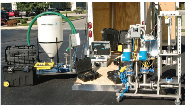
For fast turnaround to keep you running, we can bring the calibration rig to you for on-site calibration

We know accuracy in measuring is crucial when dealing with expensive fluids. This is why Endress+Hauser has developed the world's most accurate production calibration facility. Through the "PremiumCal" calibration, Coriolis mass flowmeters can be calibrated to an accuracy of \pm 0.05\% on fully traceable production calibration rigs (ISO 17025). This is equivalent to the contents of a single champagne glass per one thousand liters of water. In addition, our Gulf Coast Calibration and Service Center, located near Houston, Texas, is also one of the most accurate flow calibration laboratories in the U.S., performing calibrations in compliance with ISO 17025 and A2LA accreditation.