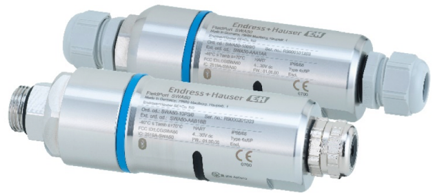
Figure 1: Endress+Hauser’s SWA50 WirelessHART/Bluetooth communication adapter enables any HART-compatible instrument to communicate wirelessly.

WirelessHART and Bluetooth instruments typically send and receive as much or more diagnostic and process data as their wired HART counterparts. While this data can provide immense benefits to a wide range of host systems and applications – such as maintenance management, asset information and health management, inventory control, and enterprise resource planning systems – many facilities do not yet take full advantage of what this data has to offer.