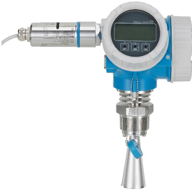
Figure 4: A hazardous waste incineration company added multiple Endress+Hauser pressure and temperature transmitters with SWA50 WirelessHART/Bluetooth communication adapters to detect scaling in its flue gas denitrification unit.

denitrification unit. The unit’s heat exchanger experienced severe scaling, reducing its efficiency, and it required extensive periods of downtime to clear the clogs.