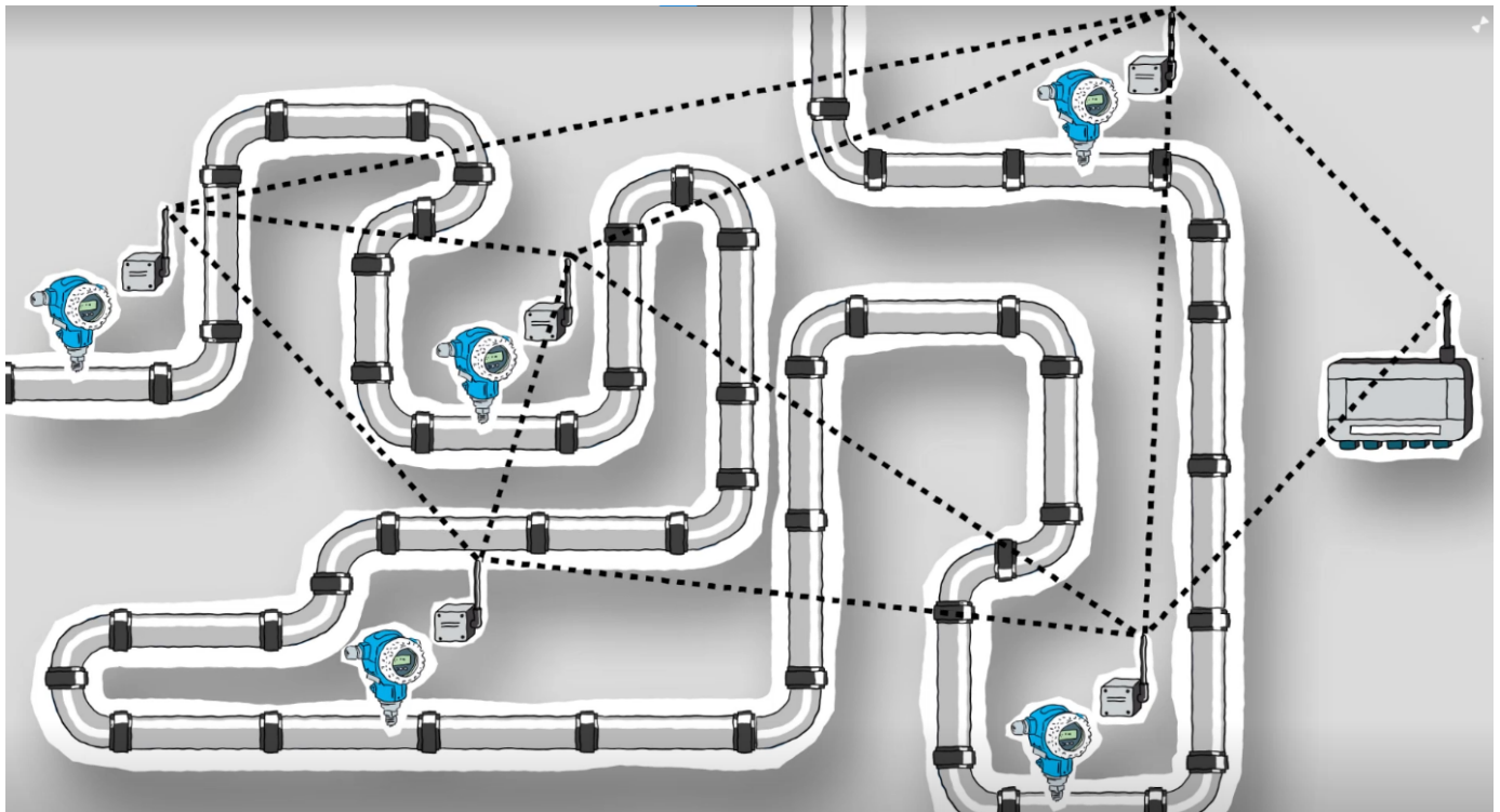
Figure 5: Wireless data transmission and collection at Endress+Hauser’s Fieldgate SWG70 edge gateway eliminates the need for conduits and wires between instruments and host systems.

For public utilities, an upgrade to digital communications and smart instrumentation serves to supply edge- or cloud-based tools with water, air, gas, electricity, and steam consumption