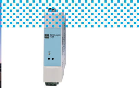
RN221N active barrier and power supply