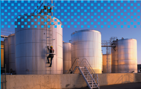
Hazardous chemical storage

RN221N is used as an intrinsically safe barrier and power supply