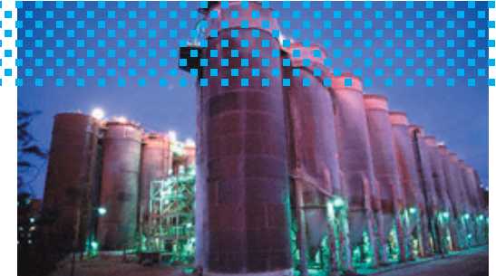
Protection in dust hazardous storage

The RN221N is a FM certified active intrinsically safe barrier with integral power supply for safe isolation of 4 to 20 mA current circuits.