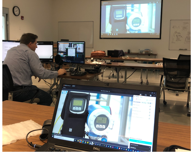
Popular delivery tool with GoToTraining™— providing access right to your location, view on your computer or on a larger screen