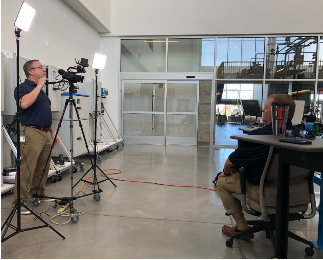
Certified instructors providing step-by-step detailed instructions through quality HD 4K cameras