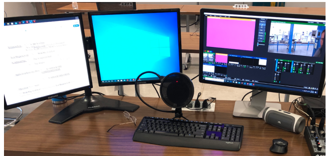
Endress+Hauser uses a professional video production platform to deliver virtual training