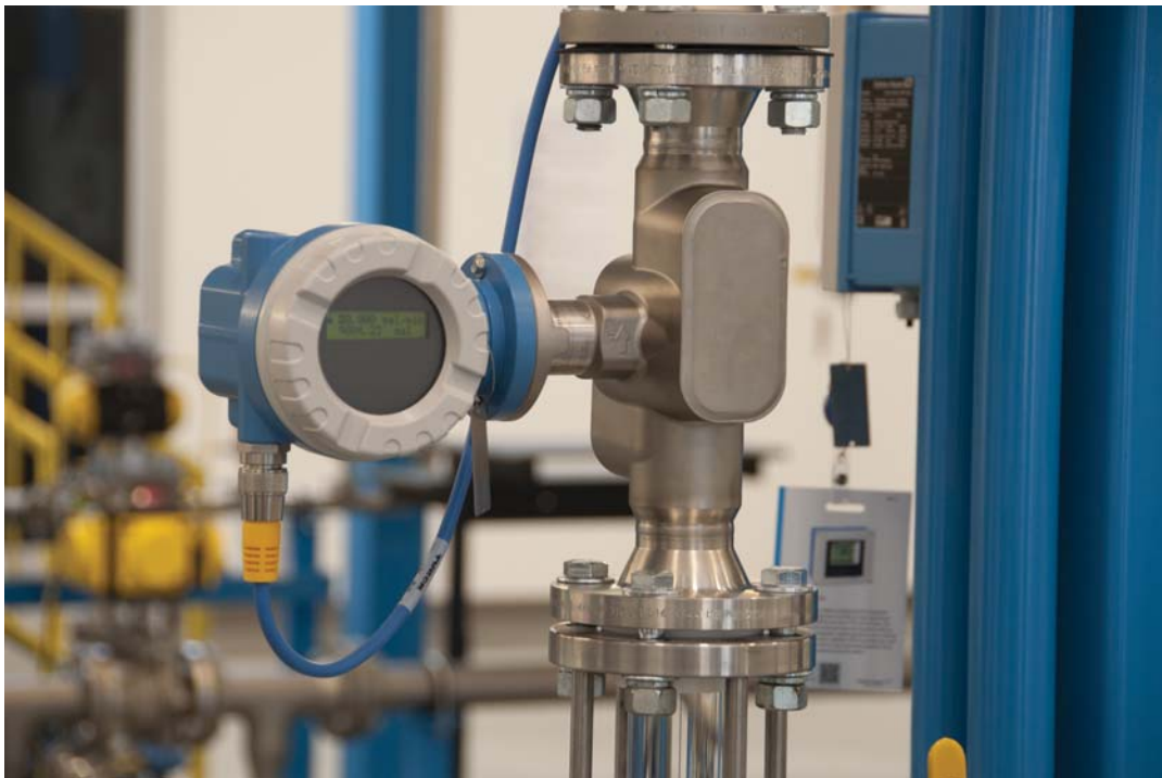
Figure 1: The world's first two-wire ultrasonic flowmeter in 2006 operated on a single, 4-20 mA 2-wire loop.

There was a major breakthrough in 2006 when the world's first true 2-wire, loop powered inline liquid ultrasonic flowmeter was introduced (Figure 1). The nature of this breakthrough was innovation in device power management. That was the missing piece up to that point, because to be a true loop powered device, it had to directly provide a full 16 mA span using less than 3.6 mA of remaining loop current and less than 1 Watt of electrical energy. The flowmeter operated on a single, 4-20 mA HART® 2-wire loop, was remotely powered by a DC supply, was certified Class 1 Division 1 and could be deployed as Intrinsically Safe through the use of an approved safety barrier.