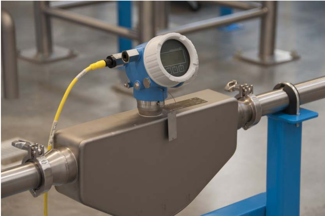
Figure 2: Two-wire Coriolis flowmeters became available in 2011.

Electromagnetic and vortex flowmeters had already been available for some years in 2-wire loop powered form, but improved performance resulted as these designs were incorporated into their new, common electronics platform in 2013. So all the “modern” flow measurement technologies, that is to say those introduced post-war, have become available as 2-wire, loop powered devices with one exception, namely Thermal Mass (a.k.a. Thermal Dispersion). Unfortunately, the power requirements for this technology exceed what is deemed possible with 2-wire loop power management.