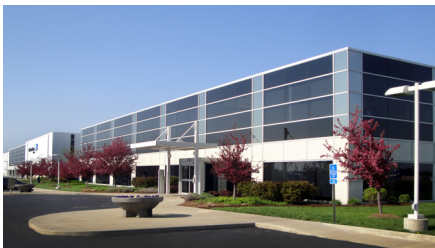
D Endress+Hauser Flow (USA) 2330 Endress PI