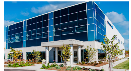
H Endress+Hauser Temperature (USA) 2375 Endress PI