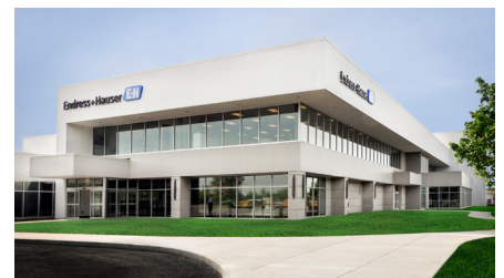
B1 Endress+Hauser USA (Customer Center) 2355 Endress PI