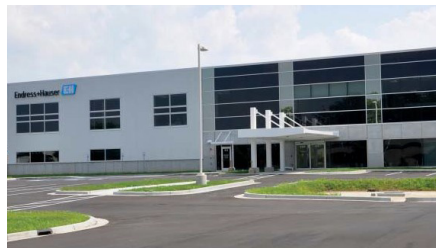
G Endress+Hauser Level+Pressure (USA) 2340 Endress PI