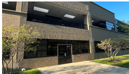
A4 Innovation Studio – Back entrance of Endress+Hauser USA (Sales Center)