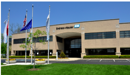
A Endress+Hauser USA (Sales Center) 2350 Endress PI